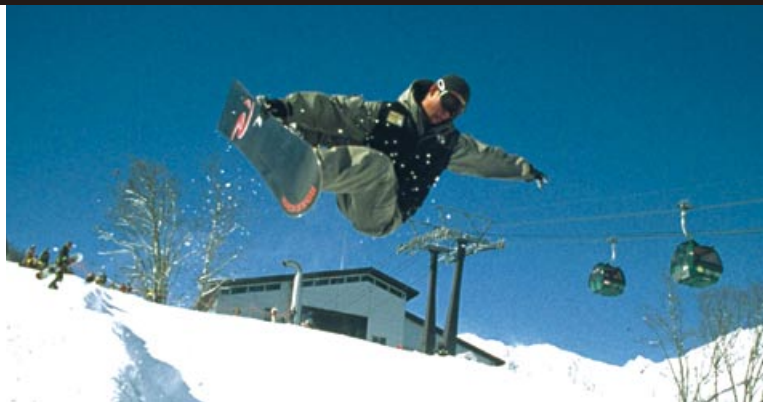
Free yourself and enjoy the splendid nature at ski sites.

Canada and Europe tend to spring to mind, but it's hard to imagine winging down the slopes the very next day. Another bonus is that the time difference between Perth and Japan is just one hour, a far cry from other ski resorts, so you'll be in fine form when you hit the slopes.