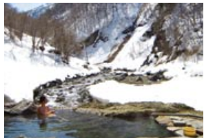
View the superb scenery and warm yourself in a hot spring.

at Nagano station in around two hours. It's then an hour's bus ride to Hakuba. In other words, you can be pulling on your ski mask about 15 hours after leaving Perth, including connection time. You'll feel like you've flown from the beach straight to the ski slopes. If you think of skiing or snowboarding,