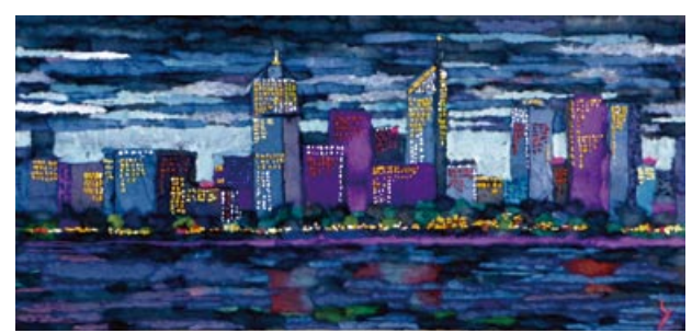
Mutsuko Bonnardeaux, cool night, 2008

"It is a long process to make paper but the satisfaction is great and you